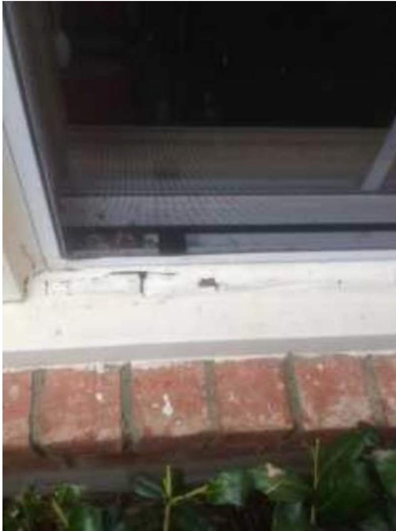
5 Phelps window trim

1820 Crestgate Dr. Waxhaw, NC 28217 office: 704-218-9606 fax: 704-498-4905