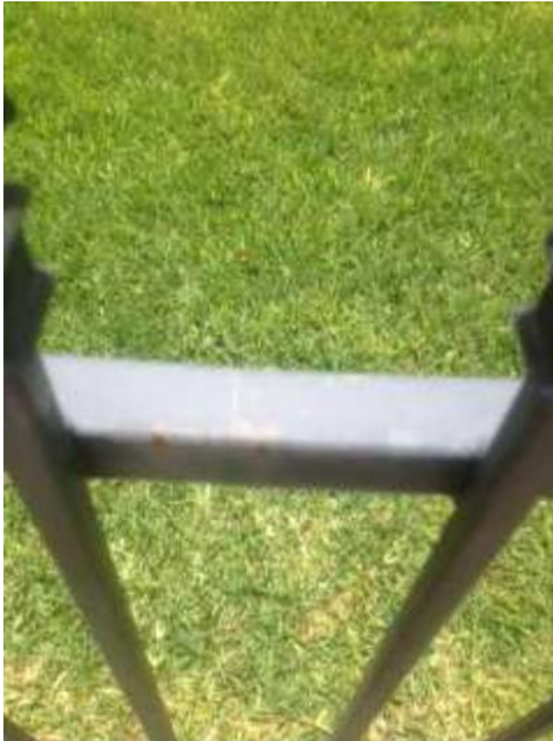
3 Phelps iron fence 3

1820 Crestgate Dr. Waxhaw, NC 28217 office: 704-218-9606 fax: 704-498-4905