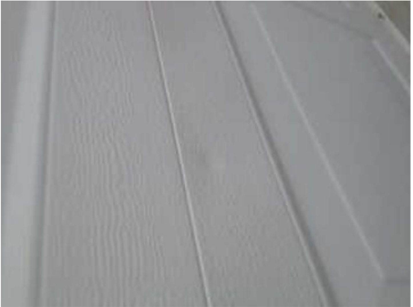
1 Phelps garage door

1820 Crestgate Dr. Waxhaw, NC 28217 office: 704-218-9606 fax: 704-498-4905